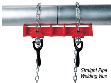
Straight Pipe Welding Vise