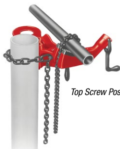
Top Screw Post Chain Vise