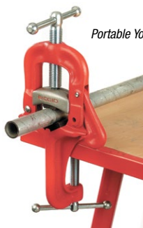
Portable Yoke Vice