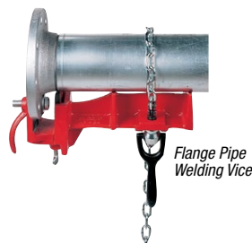
Flange Pipe Welding Vise