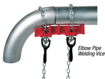
Elbow Pipe Welding Vise