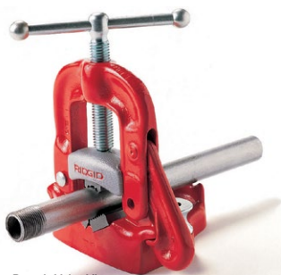
Bench Yoke Vice