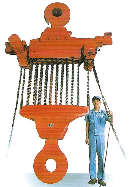
MH-5 60ton (Special version)

The ultramodern design of MH-5 electric chain hoists gives them incredibly short drawn-up dimensions and ultra-lightweights. MH-5 electric chain hoists over 30 ton have motors with high outputs for increased power for handling the extra burden of heavy loads. A large capacity MH-5 electric chain hoist directly coupled to a motorized trolley can precisely transport the load with the traverse movement of the motorized trolley. Large capacity manual operated trolleys are also available - please consult your nearest NITCHI dealer or distributor for further information.