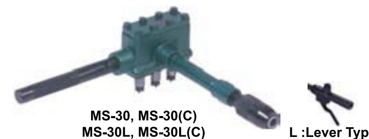
MS-30, MS-30(C) MS-30L, MS-30L(C)