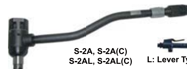
S-2A, S-2A(C) S-2AL, S-2AL(C)