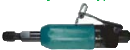
RG-38CX-06 (6mm collet) RG-38CX-20 (1/4" collet) Composite plastic housing