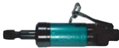
RG-383-06 (6mm collet) RG-383-20 (1/4" collet) Aluminium housing

*Back exhaust type is also available. Model: RG-38BSLW