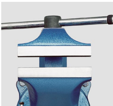
Generously sized jaws provide greater clamping surface