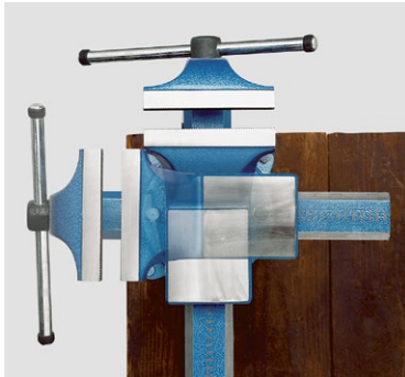
Infinitely adjustable swivel base allows vise to lock securely in any position